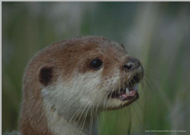
Asian small-clawed otter ( Aonyx cinereus ).

Other mammals comprise of Wild boars, Spotted deer, Porcupines and Rhesus macaque. Among the reptiles, the King cobra, the common cobra, Banded krait, Russells Viper comprise the community of venomous reptiles, while the Python, Chequered Kil-Back, Dhaman, Green Whip Snake and several other species constitute the non-venomous snakes.