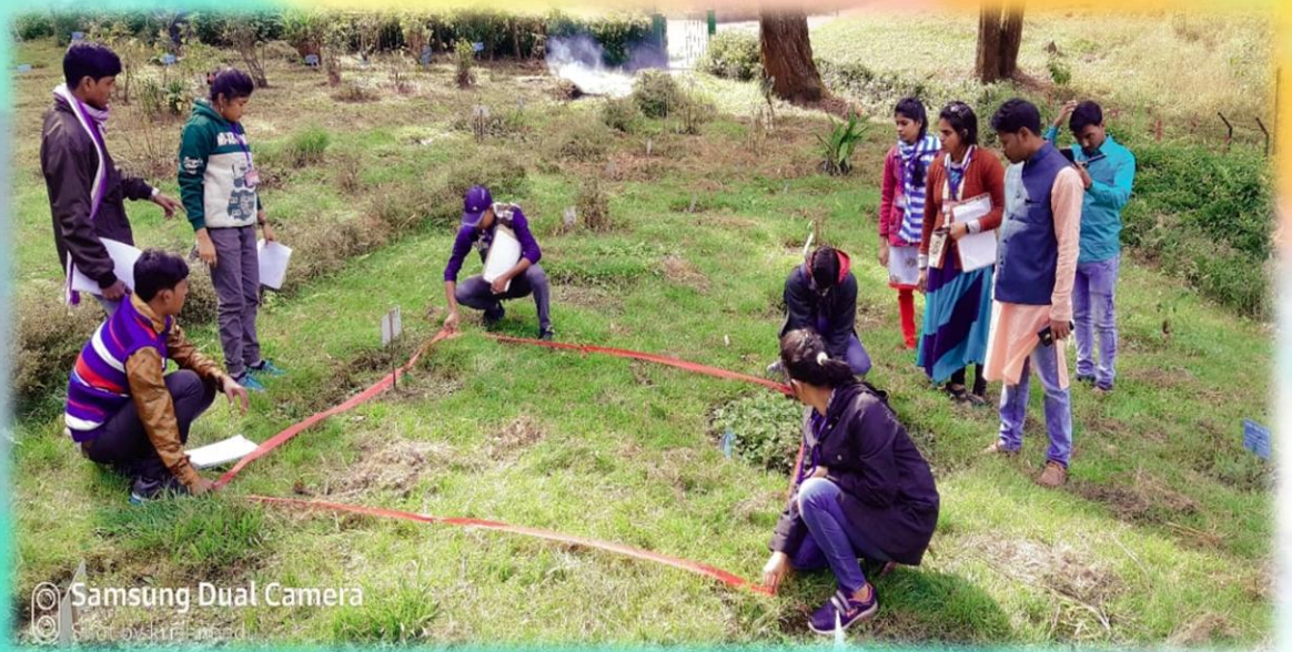
Samsung Dual Camera