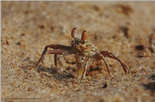
Triangular fiddler crab ( Austruca triangularis ).