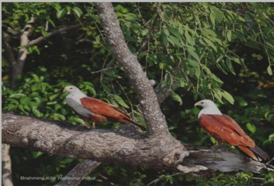
Brahminy Kite ( Haliastur indus ).

Green Pigeons, Sand Pipers, Large and Small Spoonbills, Darters, Seagulls, Teal, Partridges, great variety of Wild Geese and Ducks.