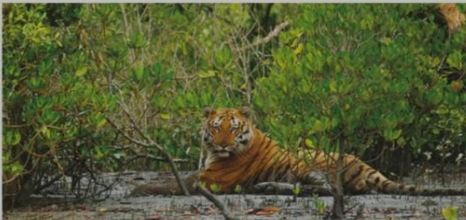
A Sunderban tiger, also known as the Royal Bengal tiger.