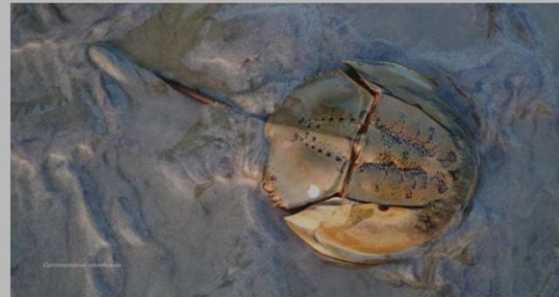
Mangrove horseshoe crab ( Carcinoscorpius rotundicauda ).