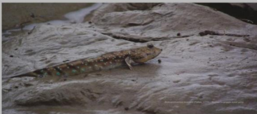
Boddart's goggle-eyed goby ( Boleopthalmus boddarti ).

foundare Whale Shark, Tiger Shark, Hammer Headed Shark, Saw fish, Guitar fish and some common edible fish e.g., Hilsa ilisha, Setipinna breviceps, Setipinna taty, Gudusia chapra etc. Among the crustaceans, commonly found are the One Armed Fiddler Crab (Uca spp) and the two species of trilobite (Tachypleus gigus and Carcinoscopus rotundicauda). The latter is also known as the Horse Shoe Crab, which is known as a living fossil and needs serious protection owing to its medicinal value and uncontrolled collection by quack doctors for commercial purpose.