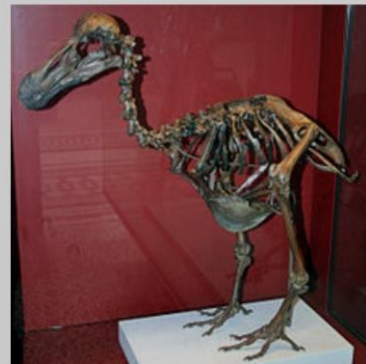
A subfossil dodo skeleton

A subfossil is a part of a dead organism that is partially, rather than fully, fossilized, as is a fossil. Subfossils of vertebrates are often found in caves or other shelters, where the remains have been preserved for thousands of years.