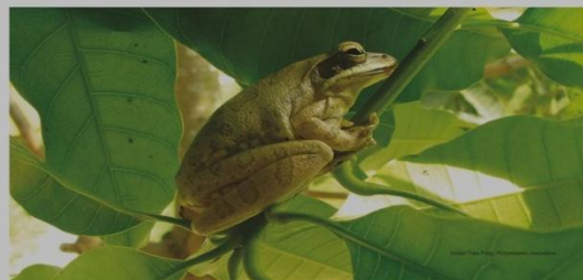
Indian Tree Frog ( Polypedates maculatus ).