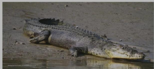
Estuarine Crocodile ( Crocodylus porosus ).