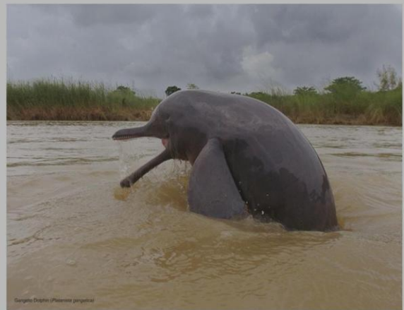
Gangetic Dolphin ( Platanista gangetica ).