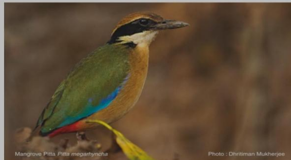
Mangrove Pitta ( Pitta megarhyncha ).