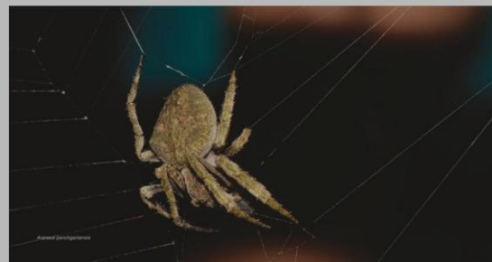
Araneus panchganiensis . Photo Credit: Contributors of the Compendium by the Zoological Survey of India, Kolkata, India.