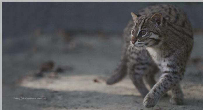
Fishing cat ( Prionailurus viverrinus ).