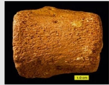
Eroded Jurassic plesiosaur vertebral centrum found in the Lower Cretaceous Faringdon Sponge Gravels in Faringdon, England. An example of a remanié fossil.

A derived fossil is a fossil found in rock made later than when the fossilized animal or plant died: it happens when a hard fossil is freed from a soft rock formation by erosion and redeposited in a currently forming sediment deposit. Another name for such a specimen is a reworked fossil.