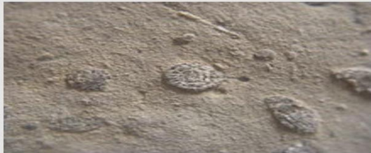
Microfossils about 1 mm

Microfossils are the tiny remains of bacteria, protists, fungi, animals, and plants . For example, fossils of bacteria, foraminifera, diatoms, very small invertebrate shells or skeletons, pollen, and tiny bones and teeth of large vertebrates, among others, can be called microfossils. But it is an unnatural grouping.