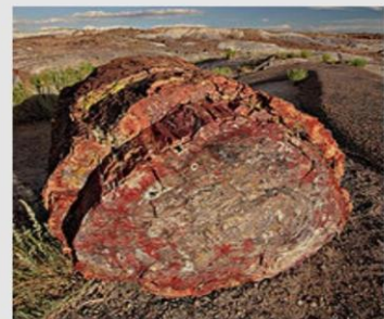
Petrified wood. The internal structure of the tree and bark are maintained in the permineralization process.

Fossil wood is a type of wood that is preserved in the fossil record. Over time the wood will usually be the part of a plant that is best preserved. Fossil wood may or may not be petrified.